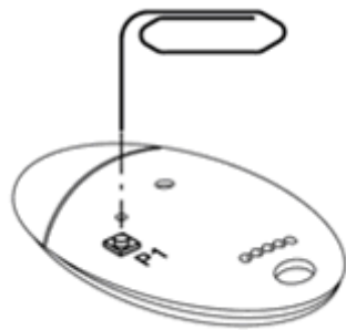
Old type Mitto

(If it has no hidden button use the top two front buttons together instead)